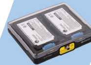
Dual Battery Charger